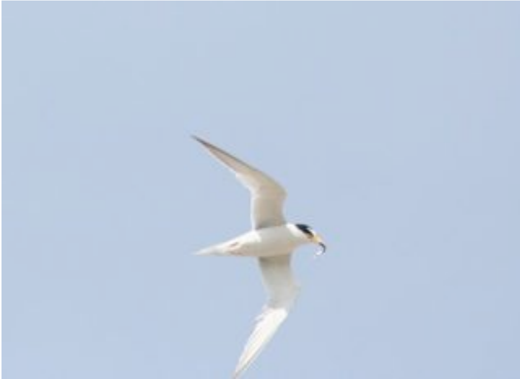
Adult with sand-eel