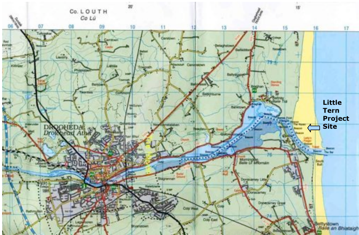
Map showing little tern project site

week after the little terns began prospecting to see which areas they were favouring. They were using the entire shingle area, and it was decided to enclose most of it starting from close to the Boyne wall and stretching northward, to reduce the probability of breeding failure caused by mammalian predators and to protect them from human disturbance. The specific nest sites chosen did not have a particular pattern, i.e. little terns nested in high and low areas.