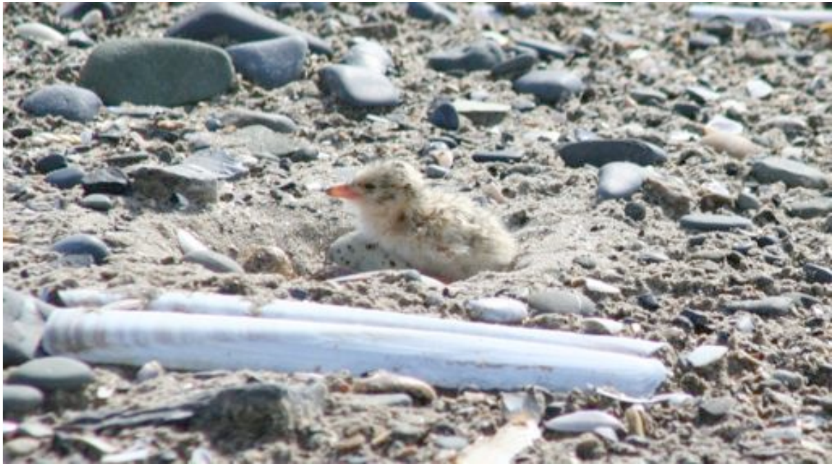
Newly born chick with unhatched egg

Walkers: - We also had a huge amount of co-operation from walkers, many of whom changed their normal routes to completely avoid the area. Again the volunteer presence was essential and much time was spent in directing walkers away from the area. In spite of all the signage, some people approached the enclosure. It would be fair to say that over 95% of people co-operated when approached by the volunteers. Quite a few walkers walked up along the string cordon on the beach side, probably to avoid the soft sand and this disturbed the nesting birds. We used 8' posts on the east side which meant that we could put it further out from the enclosure. Walkers tend to walk right along the cordon so it should be put further out so that the nesting birds are not disturbed.