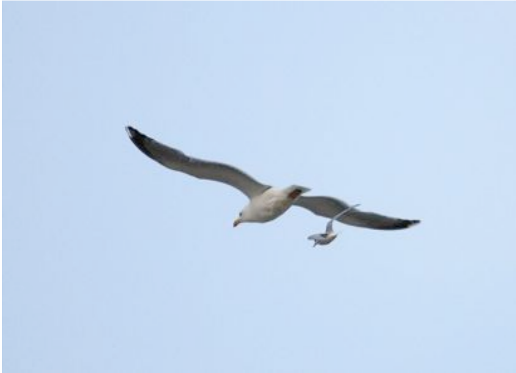
Little tern adult chasing away gull