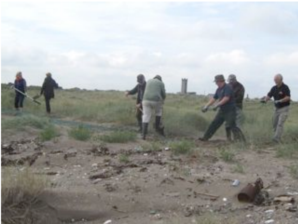
Dismantling fence Aug 2012

Dempsey Mullen who provide accountancy services.