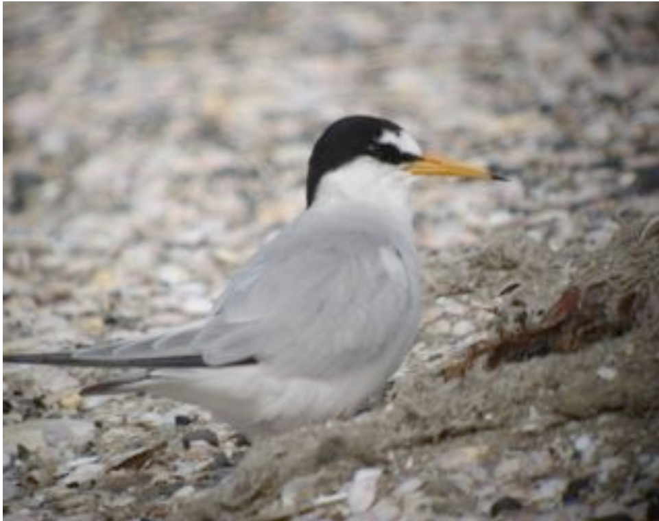
Little Tern adult

Having spent the winter off the west coast of Africa, little terns migrate to Europe to breed, arriving in Ireland from late April. A clutch of one to three eggs is laid in late May or June. The incubation period is around 21 days. At about 14 days chicks make their first attempts at flight, but do not fully fledge until about 28 days. Little terns leave their colony in August, departing Ireland in September.