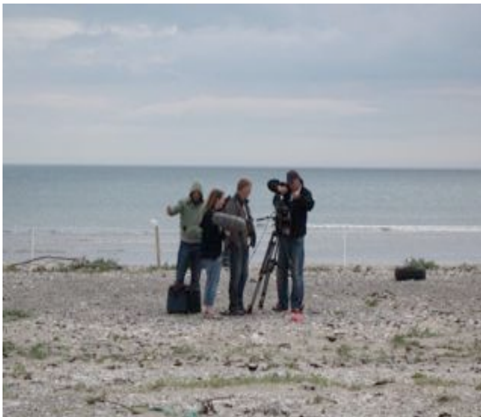
Film crew for the RTE Zoo series.