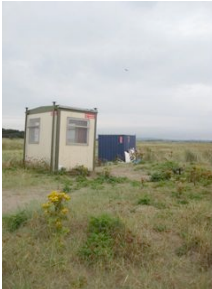
Portacabin & storage container

2012 was a poor summer with higher than average rainfall. Temperatures were generally in the low to mid teens. A portacabin and portaloos were hired at the end of May when wardening began and retained until the end of August. This was essential as we put partial overnight wardening in place at that time.